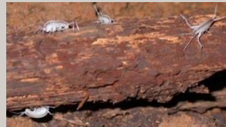
Right, Kauai cave amphipod; below, Kauai blind cave wolf spider.

Total darkness constantly envelopes the most remote parts of the cave -- low, mazelike passages that are home to some of Hawai'i's rarest of many rare creatures. These are blind cave invertebrates, pale amphipods and isopods, and their predator, an eyeless cave spider. They occur only in this cave and a small number of lava tubes between here and the adjacent town of Koloa.