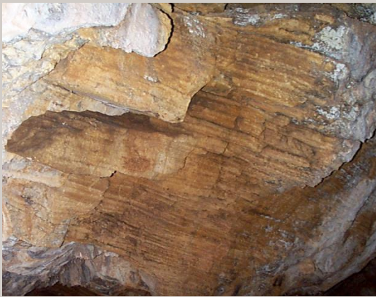
Above, diagonal sand layers were laid down by the winds that built these fossil dunes; center, water flowing through cracks made these stone "draperies;" bottom, condensation forms stone "popcorn" on the ceiling.