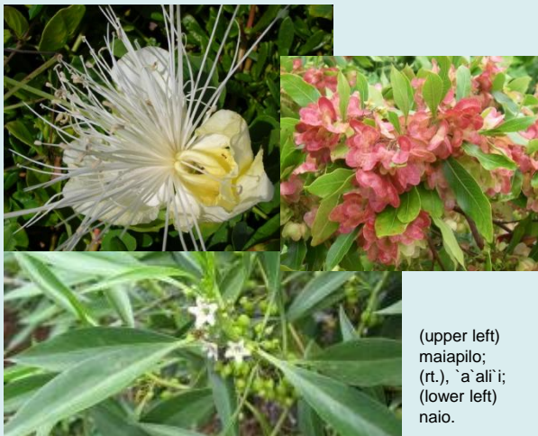
(upper left) maiapilo; (rt.), ‘a’ali’i; (lower left) naio.

5. NATIVE “ROCK GARDEN” PLANTS. Some beautiful and sweet-smelling native flowers have been re-introduced to this landscape that are commonly found as fossils in the cave sediments. These include the night-blooming caper plant, maiapilo ( Capparis sandwichiana ) and the naio shrub ( Myoporum sandwicense ). Like the hardy ‘a’ali’i shrub ( Dodonaea viscosa ) they send down long roots into the cave in search of water.