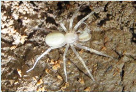
Blind cave spider eating a blind cave amphipod, two rare cave-dwellers living below ground here.

4. ON TOP OF THE CAVE. As you make your way carefully down this winding trail, you are walking on the “headprint” of a large cave passage underneath. Below ground live organisms specialized for life in total darkness, including blind cave invertebrates. The subterranean food chain begins with substances exuded from the roots of native plants featured here.