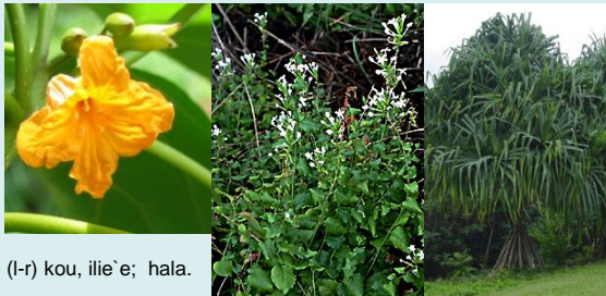
(l-r) kou, ilie`e; hala.

13. "SOFT" RESTORATION. With our help, this woodland is turning gradually from non-native to native plants. At your feet is a verdant groundcover of ilie`e ( Plumbago zeylanica ), used by ancient Hawaiians to make tattoo ink. To protect the fragile cave environment, this type of habitat must be changed slowly, to ensure that the sinkhole is always protected from salt spray and wind, even while changing the ecosystem back to native species.