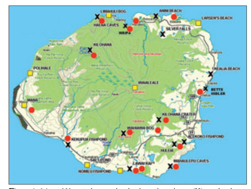
Figure 2. Map of Kaua`i showing dated paleoecological sites (X), undated sites (yellow boxes), and restoration sites (red dots) that have utilized paleoecological data. Makauwahi Cave Reserve encompasses the Maha`ulepu Caves site and additional abandoned farmlands.

3), each following guidelines constructed after years of research in palynology, paleontology, archaeology, history, and ethnography focused on the site.