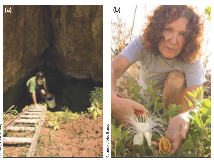
Figure 4. (a) DAB climbs out of a deep pit with a bucket of excavated sediment containing bones, shells, seeds, and other fossils from extinct and endangered biota of Kaua'i. (b) LPB harvests a seed pod to grow more maiapilo, or Hawaiian capers (Capparis sandwichiana), common as a fossil in the Makauwahi Cave sediments and still growing nearby today. These plants are featured in the restoration unit above the cave because experts on the blind cave biota have found that nutritious exudates on the roots of this plant, which extend into the cave environment, form the base of the troglobitic food web.

itor the site's airborne particulates in a range of environments.